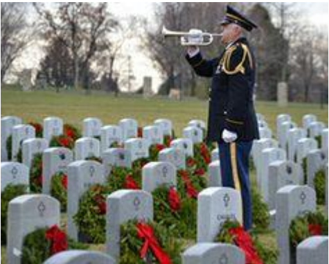
$60 donation to Massachusetts State Council for (4) Wreaths Across America